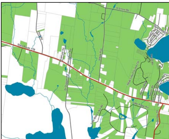
(Map 4: showing remaining Buildable Parcels )