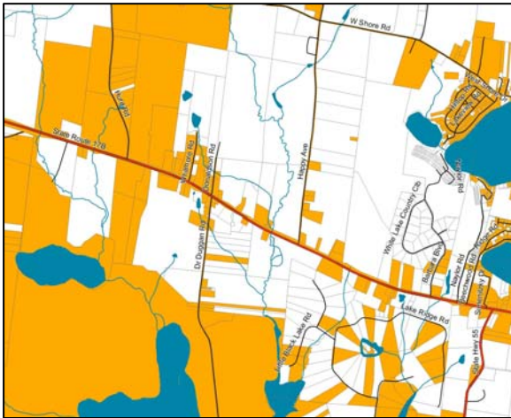
(Map 3: showing Fully Built Parcels )